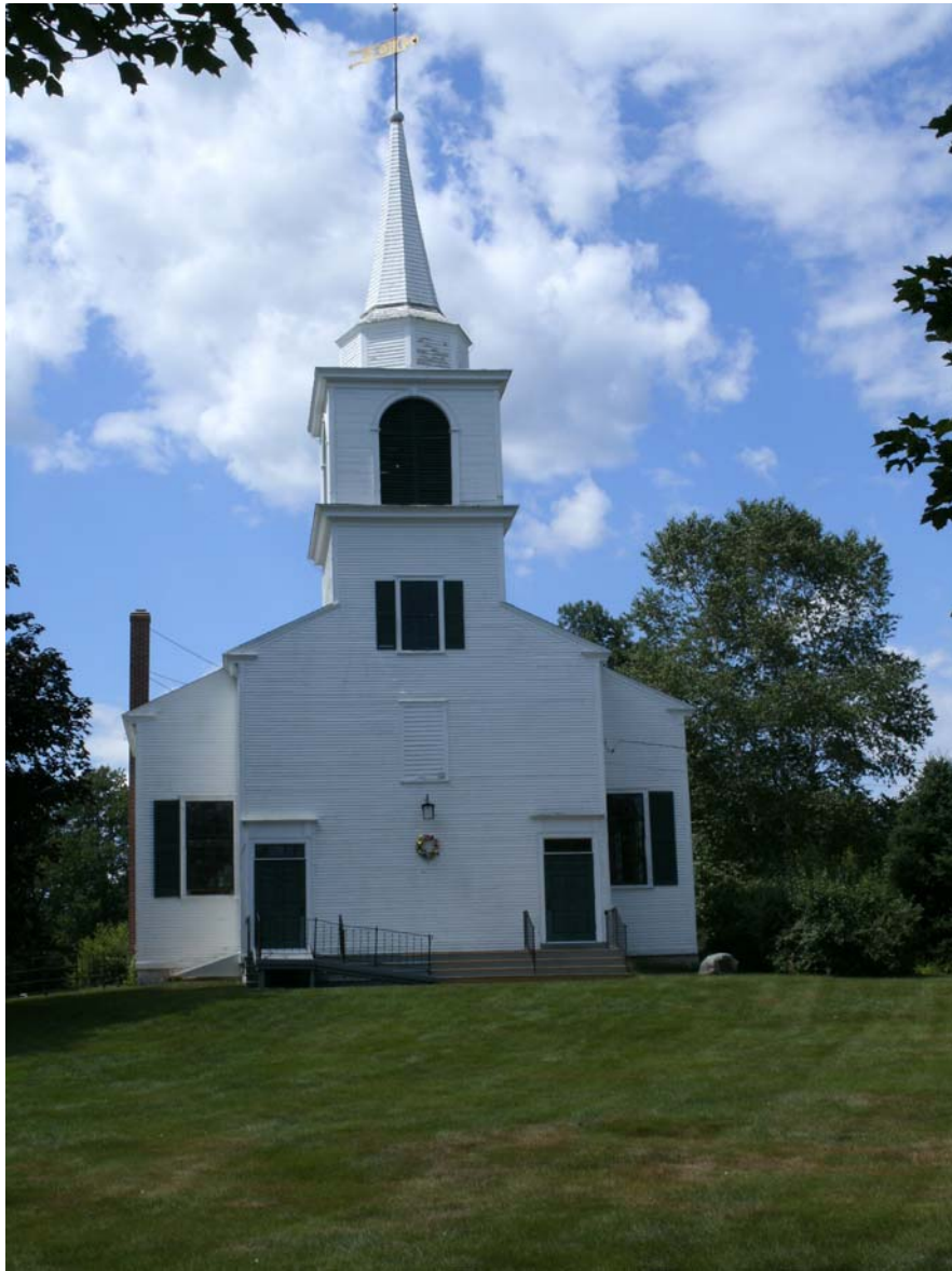
First Congregational Church of Buxton at Tory Hill (Tory Hill Meeting House) (Near the corner of Routes 112 and 202)