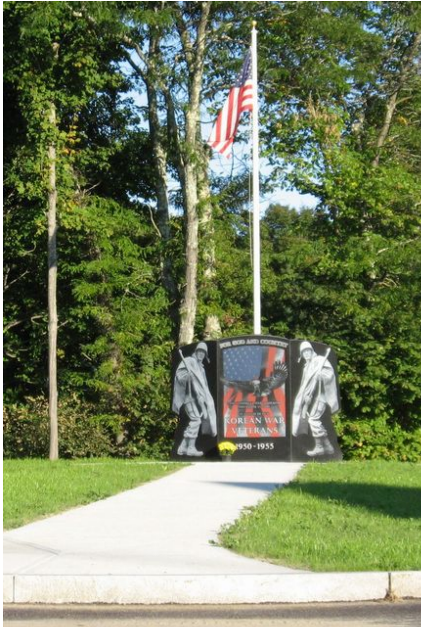
Korean War Memorial (Located at Groveville Center)

On November 11, 2006 the formal dedication ceremony took place to dedicate this Korean War Memorial honoring Veterans who served in the Korean War. The Memorial was made possible by the contributions of many citizens, veterans, friends and by a generous donation from the Narragansett Number One Foundation.